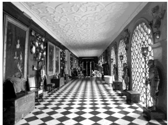
Right: The loggia at Hatfield House has now been enclosed, but Campden House could have had a similar entrance.

A possible source of inspiration for Baptist Hicks' new mansion was Hatfield House, built 1609-11 by Robert Cecil, 1 st Earl of Salisbury, who was a family friend. So the visit was both a pleasurable outing and useful research. Again we admired the long gallery and the beautiful plasterwork, and could imagine how the look of Campden House could have been influenced by Hatfield, although on a less grand scale. Not everyone admired the modern fountain but we could see that it was just the thing that Baptist Hicks would have enjoyed – a real feat of engineering combined with 'bling'!